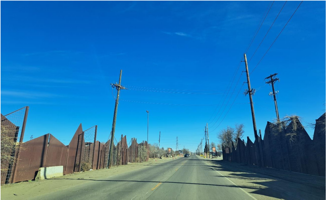
Brighton Blvd from the South