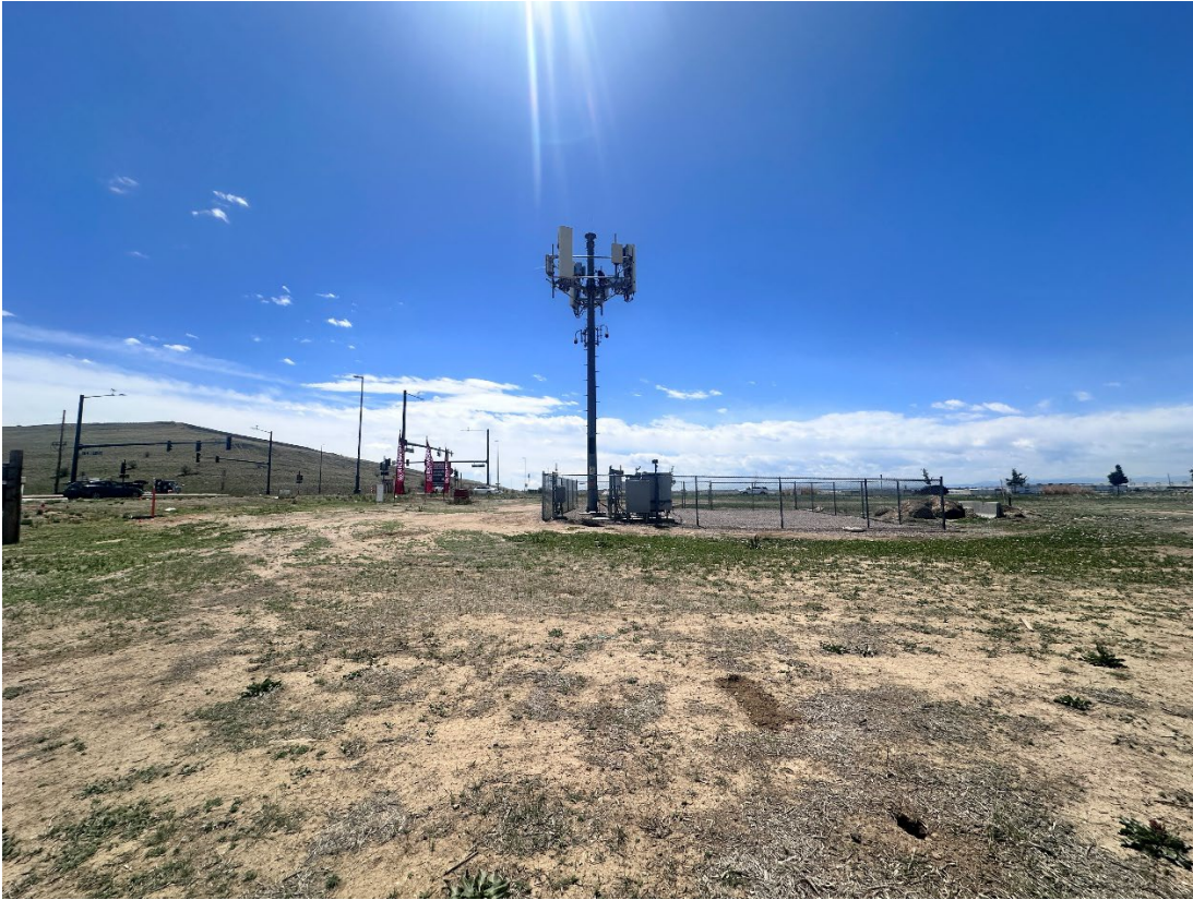
View Towards West