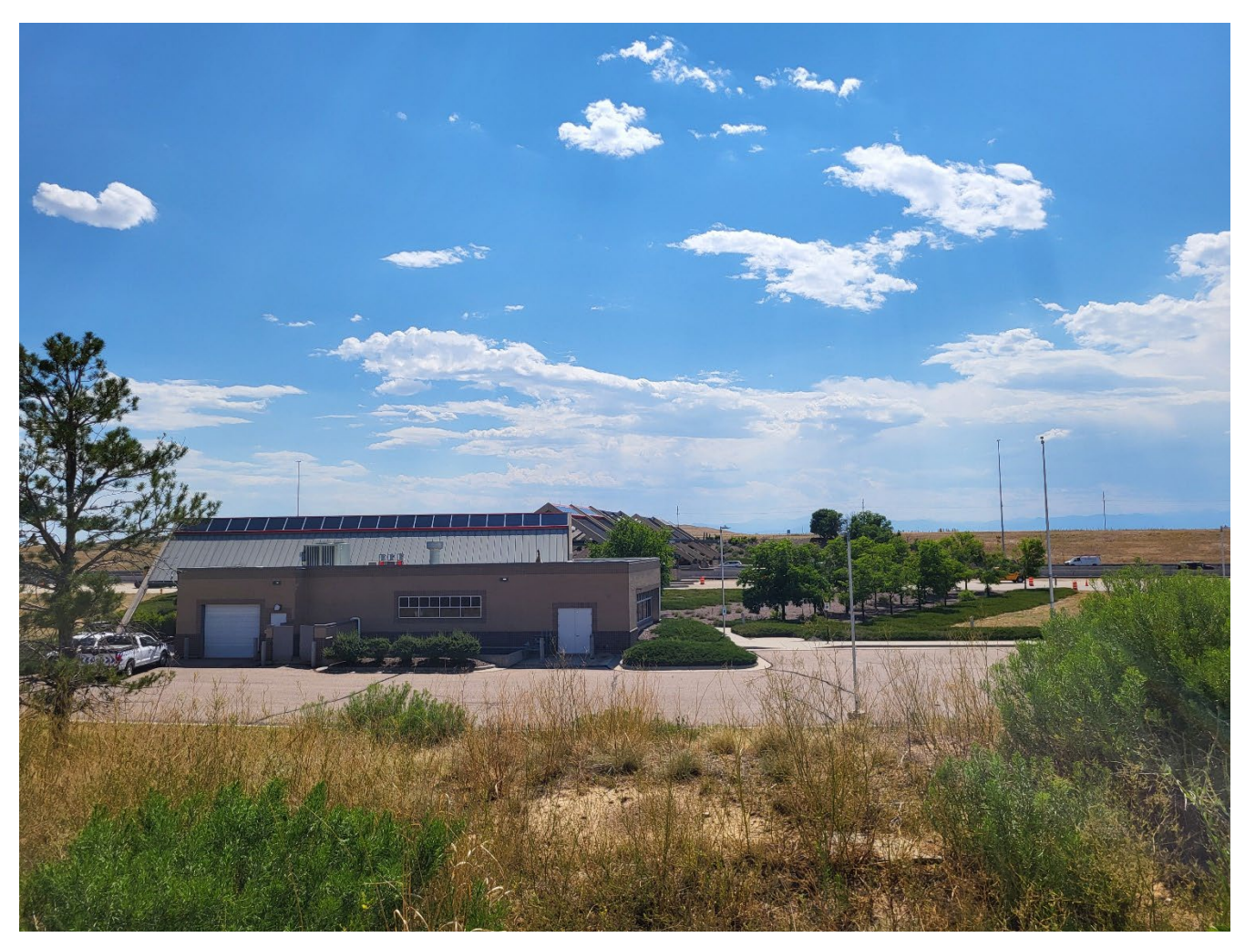
View of the existing site and E-470 facing west (Taken July 11, 2024)