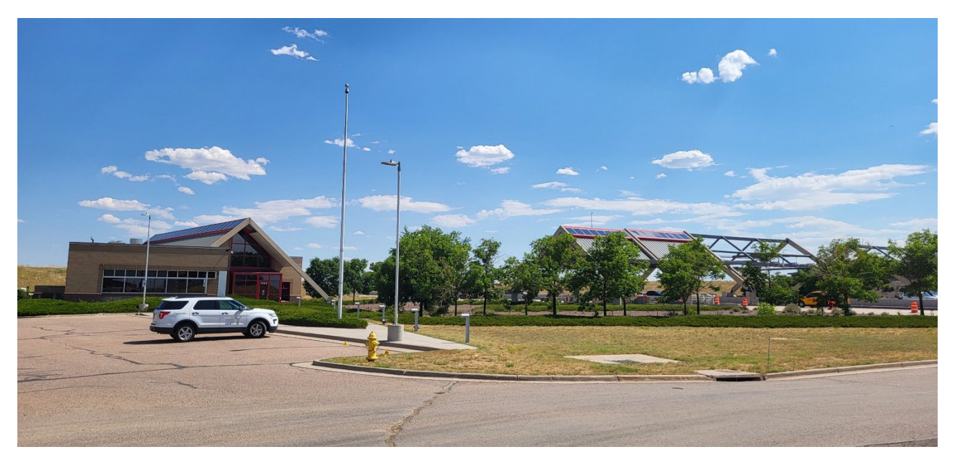
View of the existing site and E-470 facing south (Taken July 11, 2024)