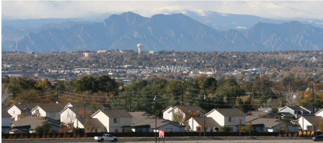
City of Commerce City