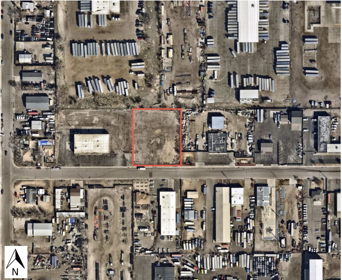
Aerial of Site Taken March 3, 2025