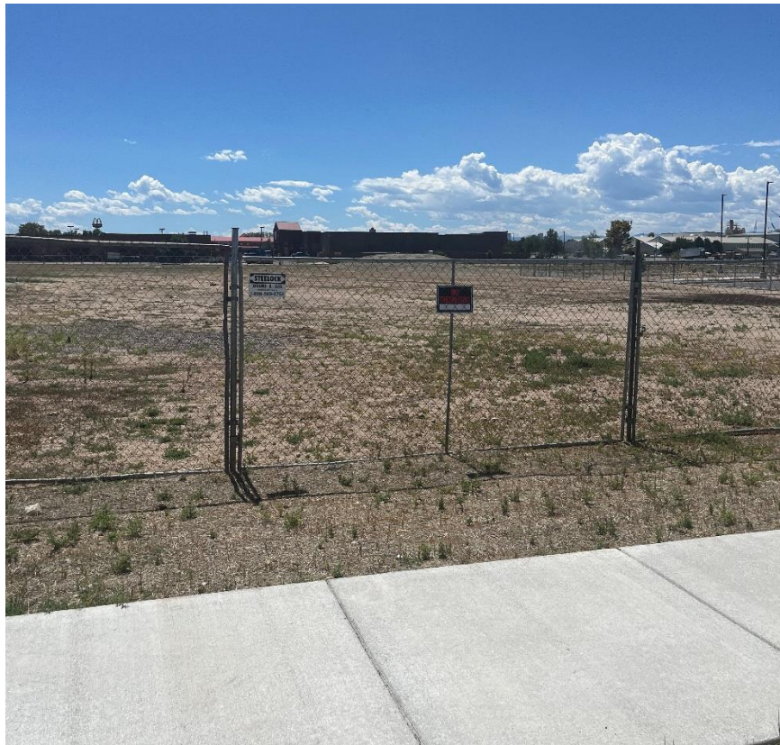
View from East 63 rd Avenue facing south (taken August 20, 2024)