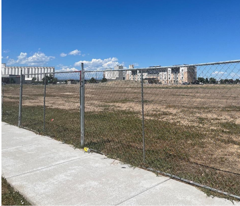
View from East 62 nd Avenue facing northwest (taken August 20, 2024)