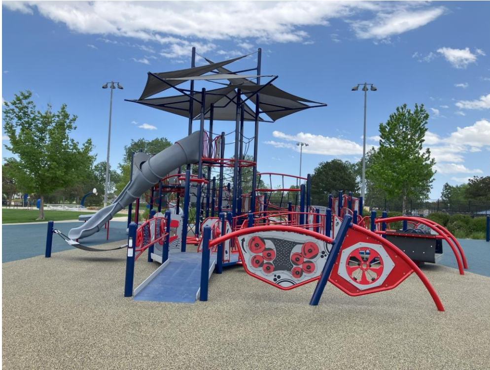
Fairfax Park Playground and Shade

The Commission receives CIP updates and is engaged in supporting capital improvements.