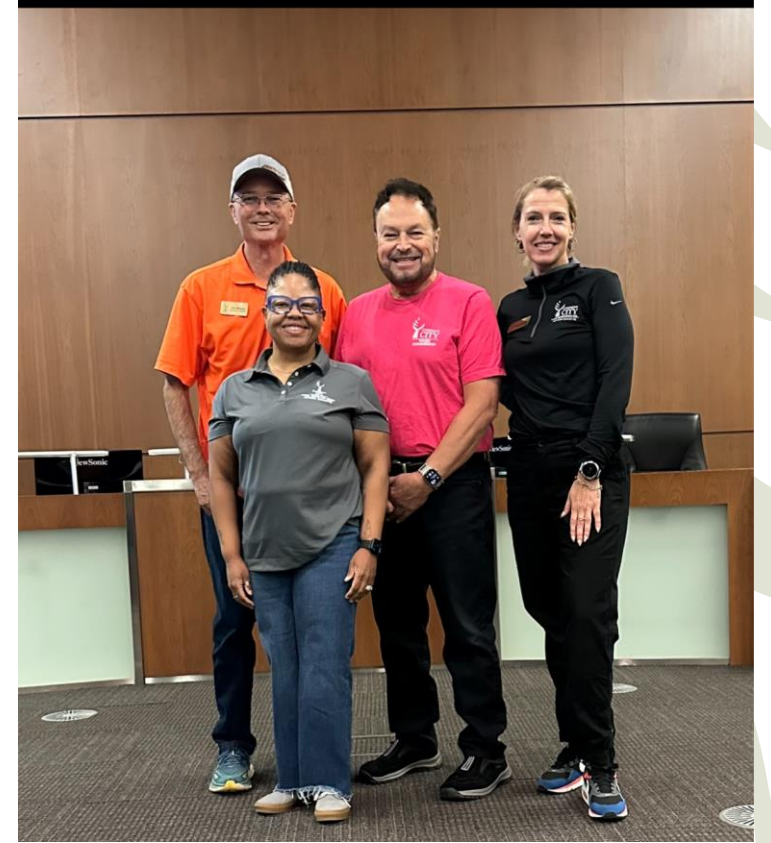
Youth Commission Town Hall