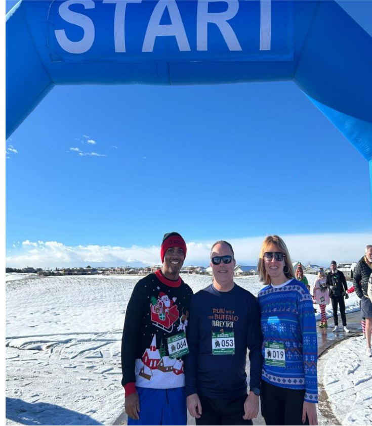
Run with the Buffalo