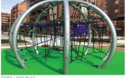
⑤ ICE RINK NODE AREAS - DOME / NET PLAY (OPTION 2)