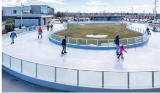
POSSIBLE WINTER ICE SKATING LOOP ③ POSSIBLE ICE RINK AREA