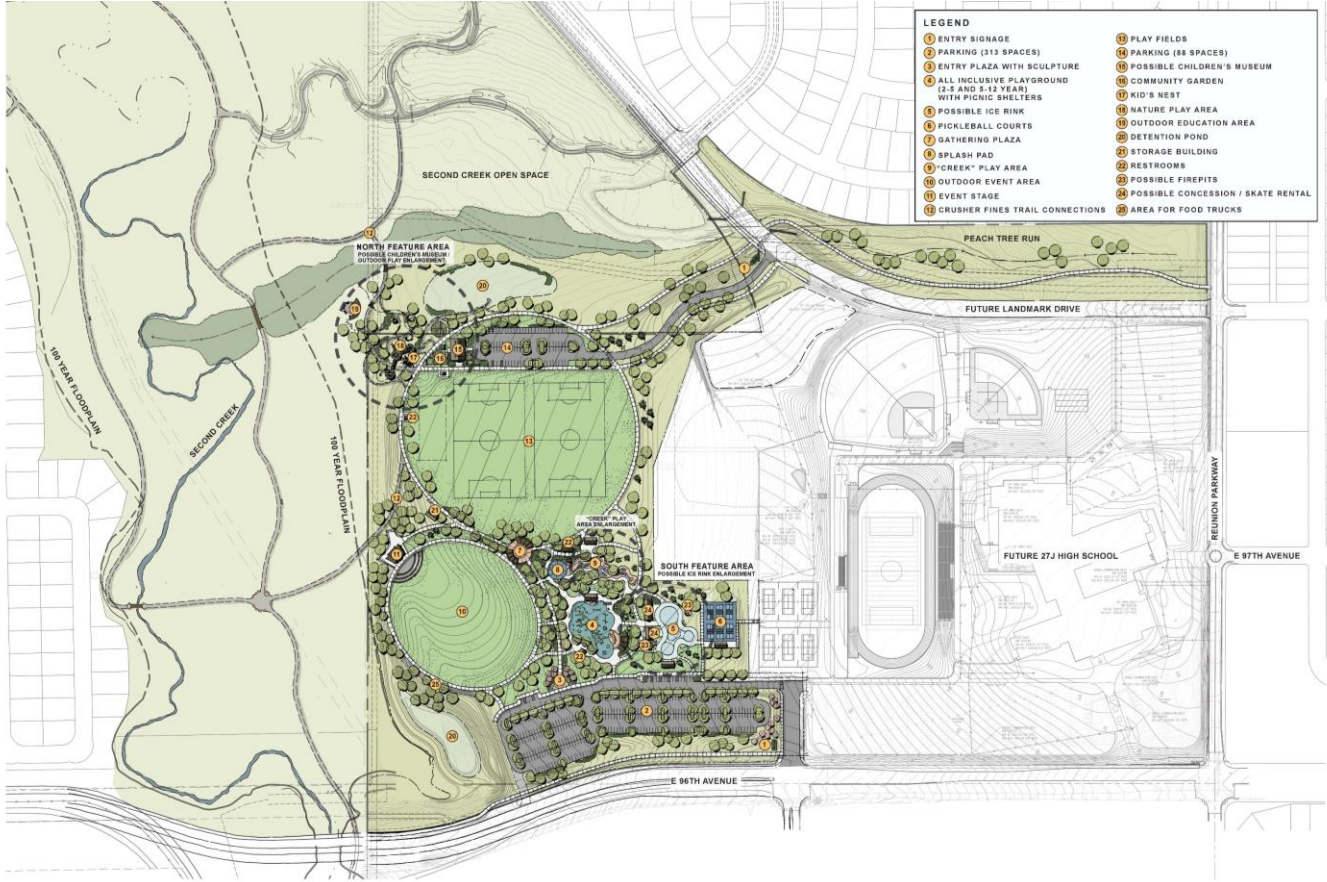
CONCEPT PLAN BUCKLEY COMMUNITY PARK COMMERCE CITY, COLORADO