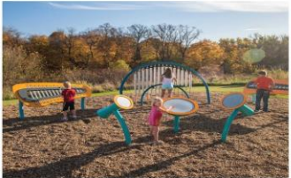
DRUMS AND CHAIRS