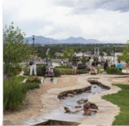
STREAM CHANNEL WITH BOULDERS ① "CREEK" PLAY AREA