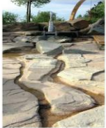
CONTOURED CONCRETE TO FORM STREAM