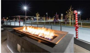
POSSIBLE FIRE PIT OUTSIDE ICE SKATING RINK ② POSSIBLE FIRE PIT