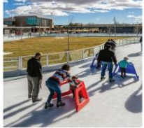
TEMPORARY EDGE WITH FENCING