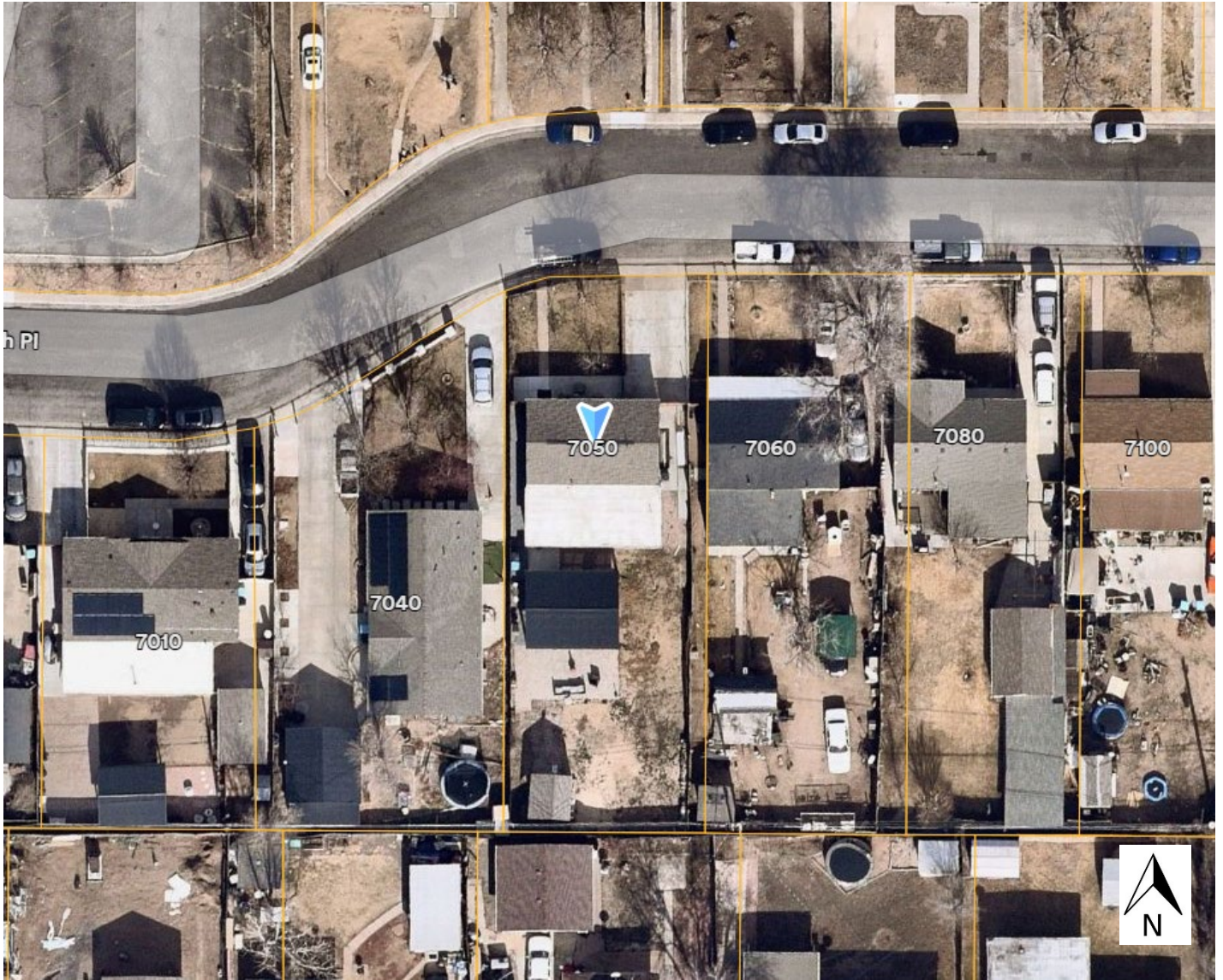
February 6, 2026 Aerial of 7050 E. 75 th Place.