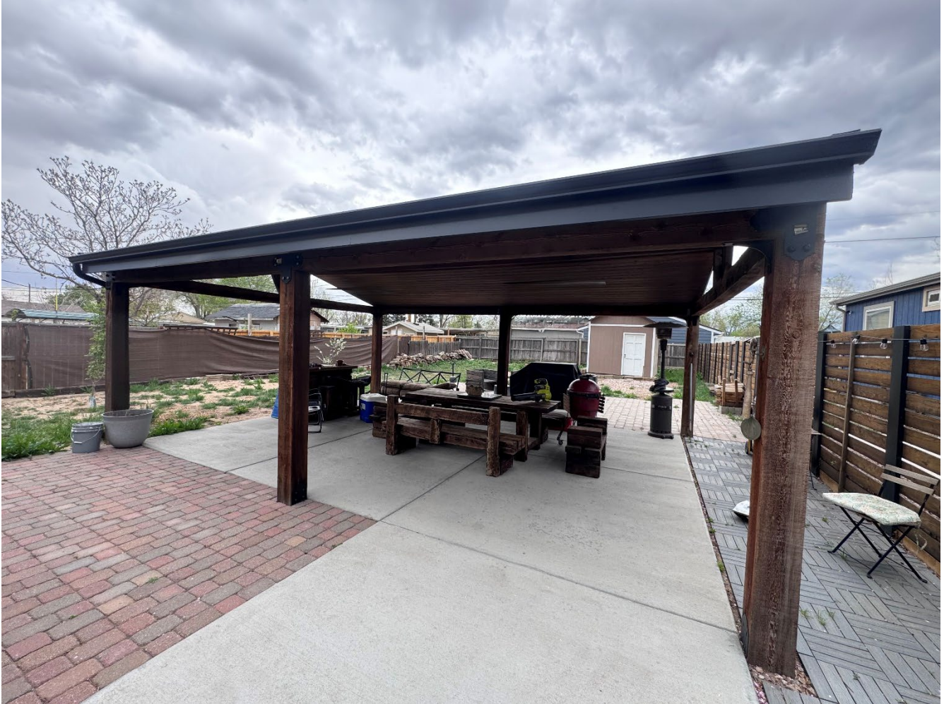
Photo of the subject shade structure facing south