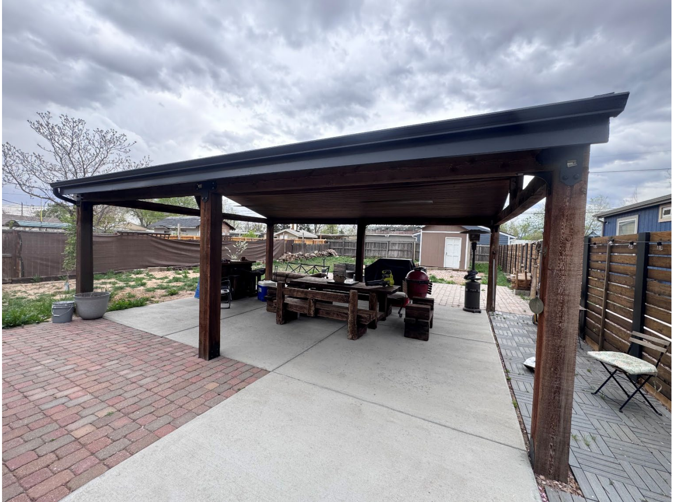
Photo of the subject shade structure facing south