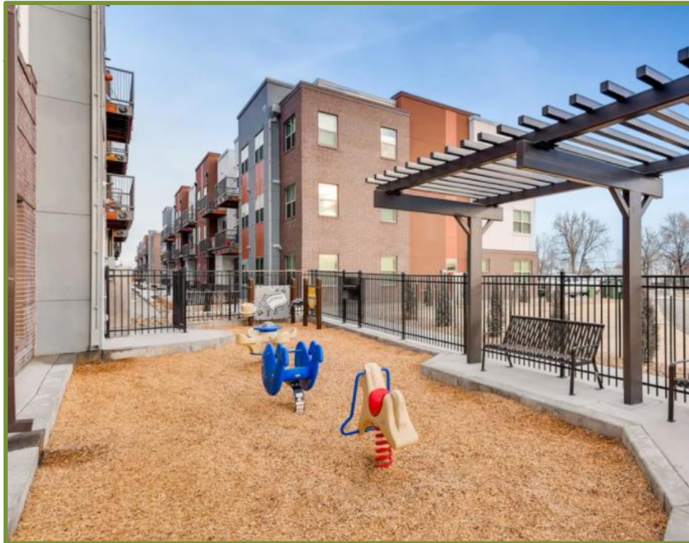
Baker School Apartments – Westminster, 150 Affordable Units