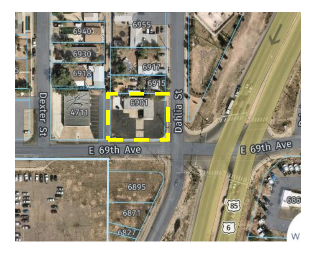
Figure 1: Site Aerial

The proposed site redevelopment is currently under administrative review in case #D-496-21. SACFD is proposing to build a 600-square foot single-story addition to the south side of the existing building for office and firefighter bunk space. Five total firefighter personnel will operate from this facility, with shift changes every other day. The overall layout of the site will remain the same, with some additional parking, landscaping, and site improvements such as the screening wall for the utility area on the east side of the building. A fenced patio area will provide space for staff outside. The existing site is almost entirely paved and this new development will improve the overall site with landscaping and other site