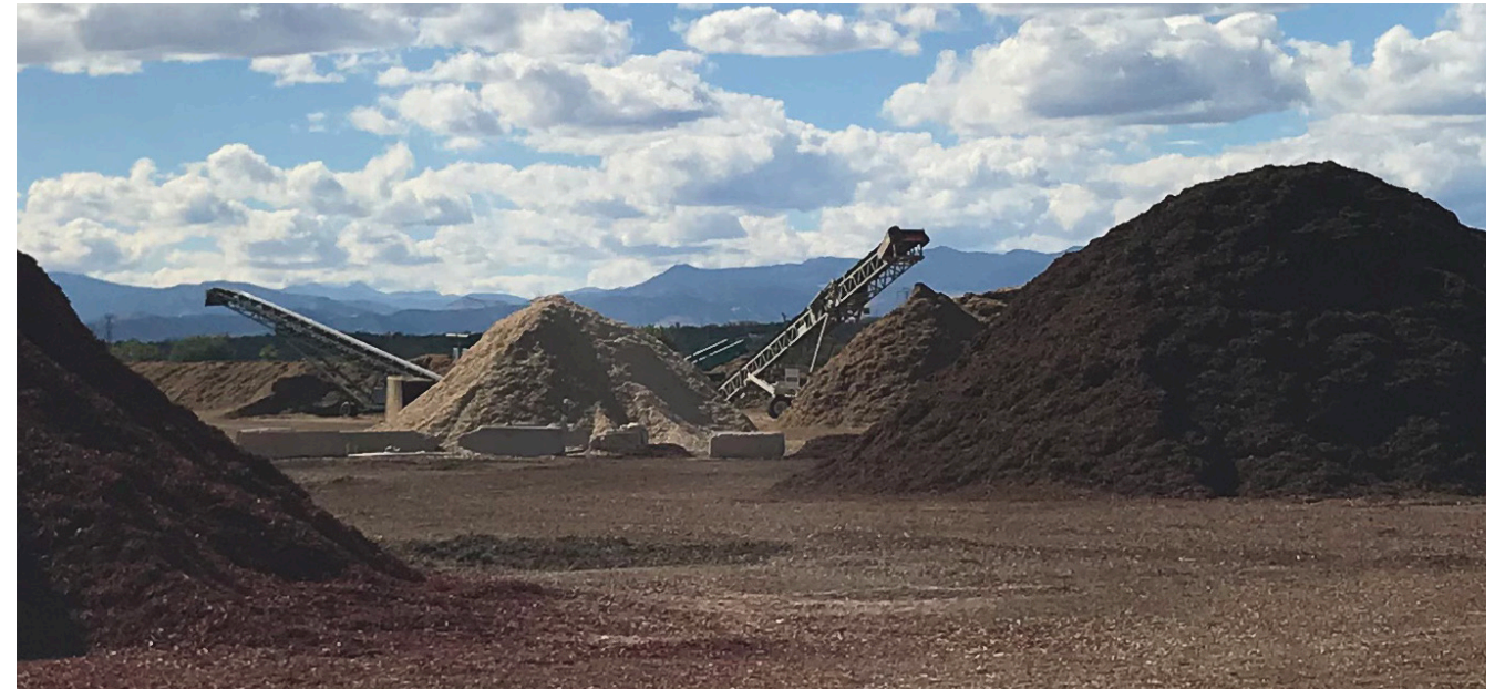
Grinding & screening