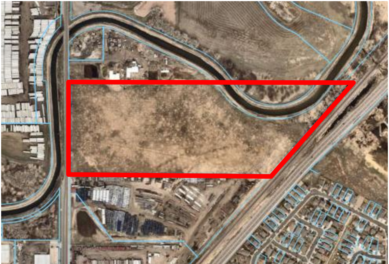
Figure 1: Site Aerial

The proposed site development is currently under review in cases #D-469-21 and S-783-21. The applicant is proposing to build three (3), approximately 30 foot tall, single-story buildings on three (3) proposed lots. Building 1 is proposed to be an approximately 99,000 square foot building on an