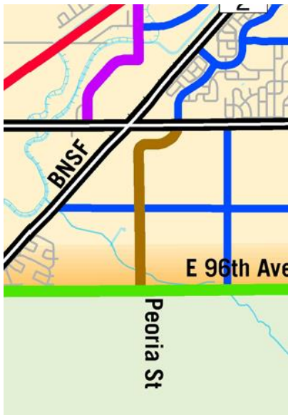
Image from the City's Transportation Master Plan showing the realignment of Peoria to Revere Street and E. 104 th Avenue

The applicant has concurrently applied for a subdivision request for Filing #5 (S-711-18-20) to bring the property into a fully entitled and developable state. Referral agencies including South Adams Fire Protection District, Tri-County Health Department, US Army, local utility providers, and various city departments have reviewed the proposal and are working with the applicant to address all comments.