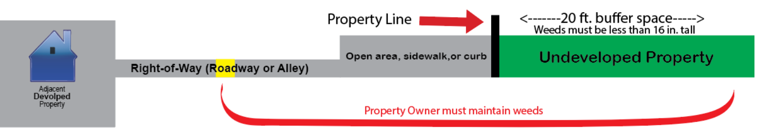
Figure 2 Property Owners are responsible for maintaining areas in the public right-of-way beyond property lines, extending to the center of the right-of-way next to the property.

Figure 1: Undeveloped property with 20 ft. of buffer space within the proepty line, measured next to any adjacent developed property, roadway, or ally.