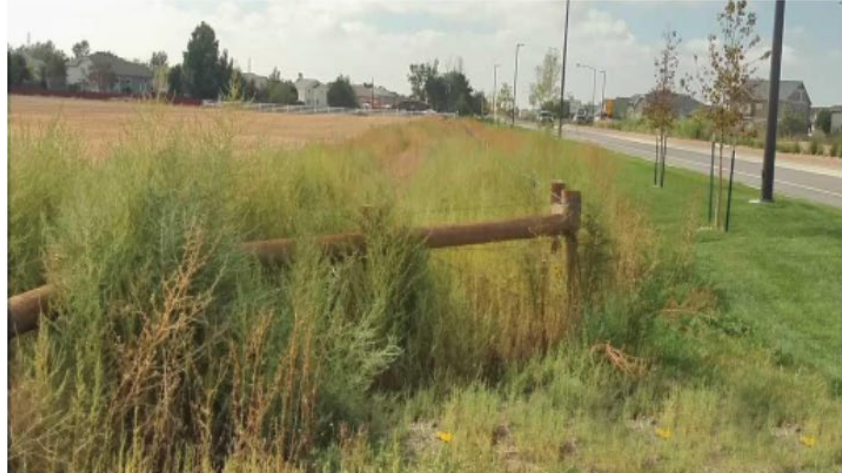
Incorrect: There is no buffer space, and weeds are not maintained beyond the property line.