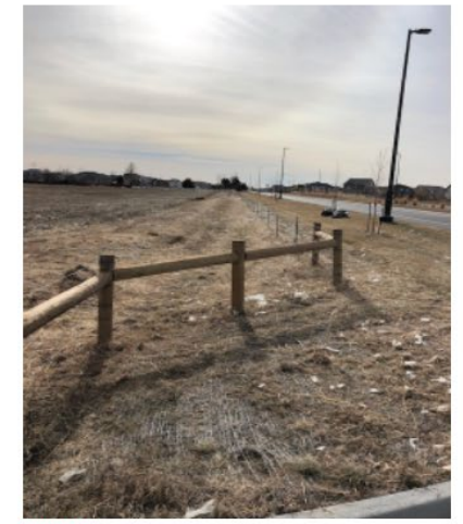
Correct: Buffer space exists and weeds are maintained beyond the property line.