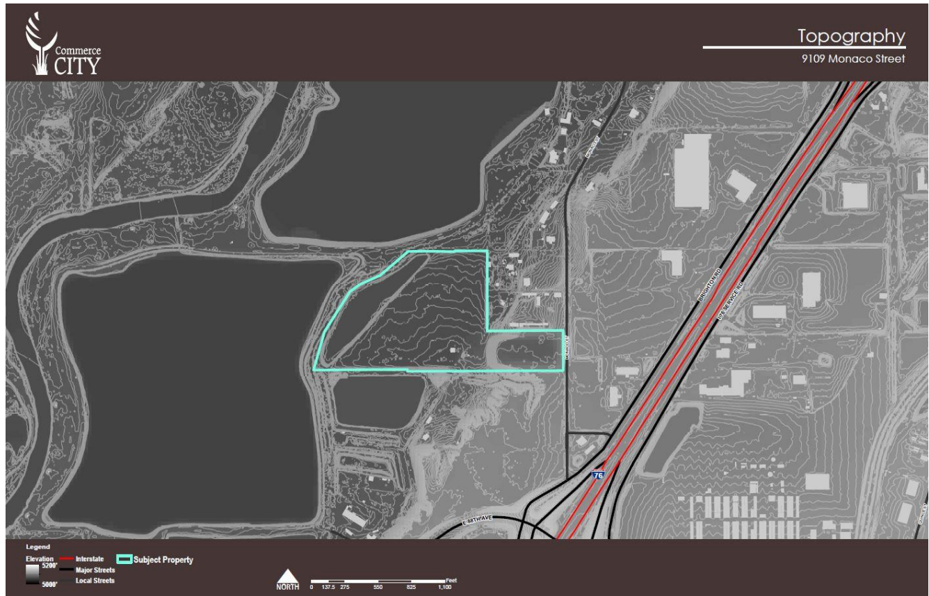
Figure 1: Site Topography

The subject property is currently zoned I-2 (medium intensity industrial district). The eastern portion of the property is currently developed as Brown Brothers Trucking, with a 19,000 square foot primary structure, and landscaping along the Monaco Street right of way. The remaining western half of the site is where A1 Organics operations are currently occurring. As shown in figures 1 & 2 below, there is a significant dropoff between the eastern half of the site and the western half of the site of around 30'-35', with the eastern portion of the site having the highest elevation near Monaco Street, and the property decreasing in elevation as it reaches the west portion of the site, and the South Platte River. This portion of the site (and the existing mulch piles that are currently in place) are not visible from the majority of surrounding areas due to this significant drop in elevation.