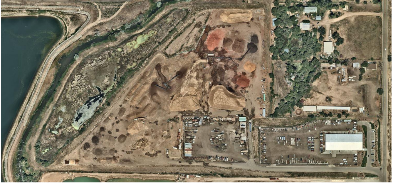
Figure 5: Aerial Imagery – June 23, 2018