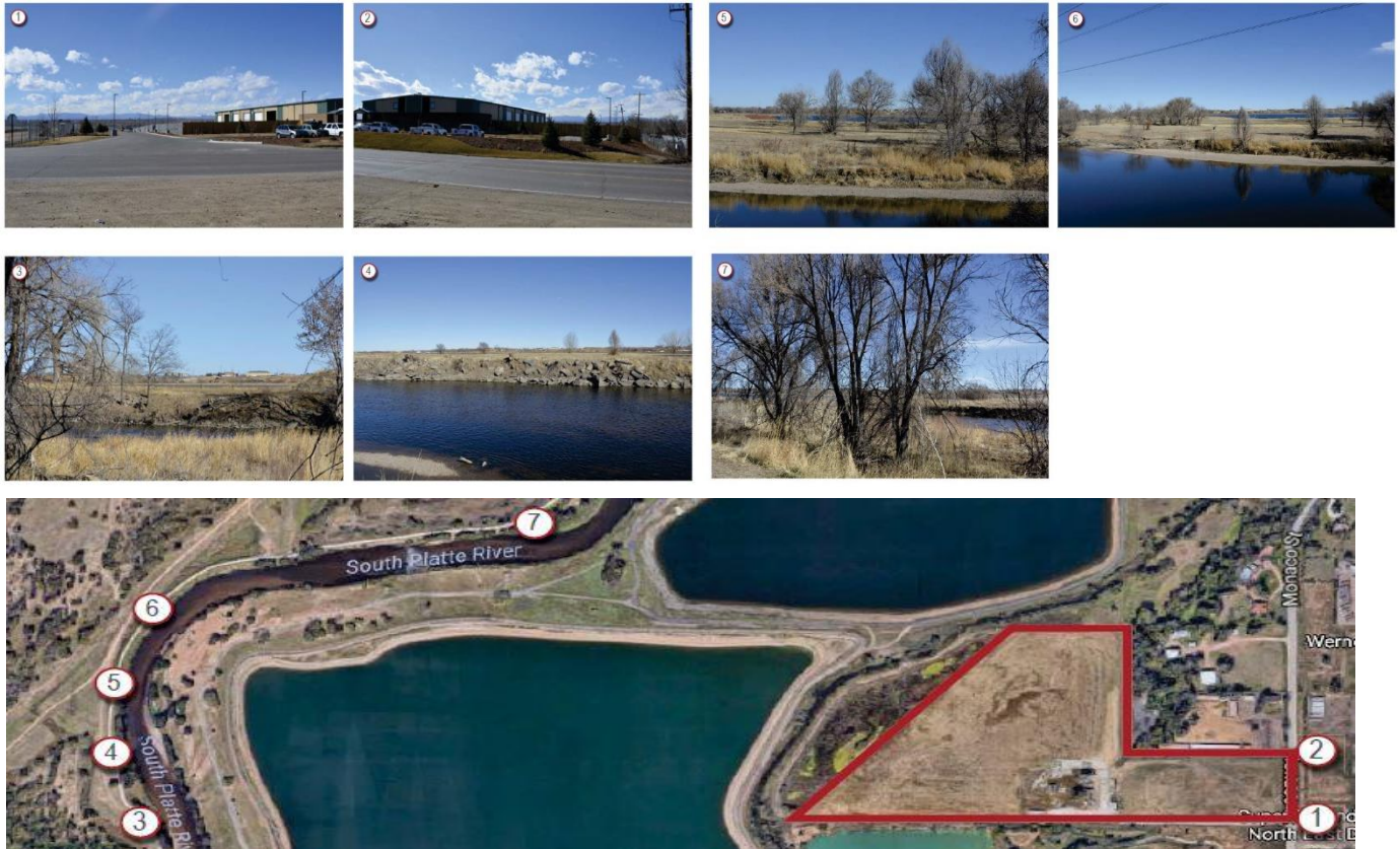
Figure 6: Photo Exhibit of Adjacent Areas

Due to the topography of the site, A1 Organics operations are not visible from the majority of surrounding areas. The property is not visible from the adjacent Monaco Street right-of-way, or East 88 th Avenue traveling towards the subject property. Heavy vegetation (at least 30' high trees) exists between the subject property and the residential properties to the north in unincorporated Adams County, which provides some visual screening of the mulch piles. Some locations where the mulch piles are at the 88 th Avenue bridge crossing Interstate 76, and a couple locations along the South Platte River trail where vegetation is not present, which is at a similar elevation as the A1 Organics site.