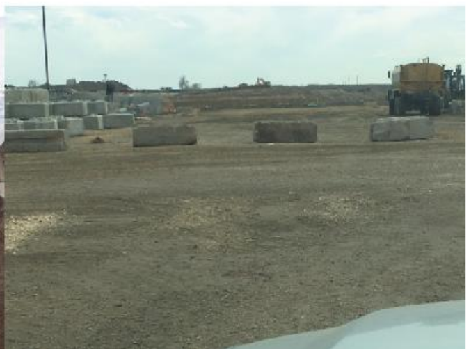
Figure 6: Existing Mulch Piles & Jersey Barriers