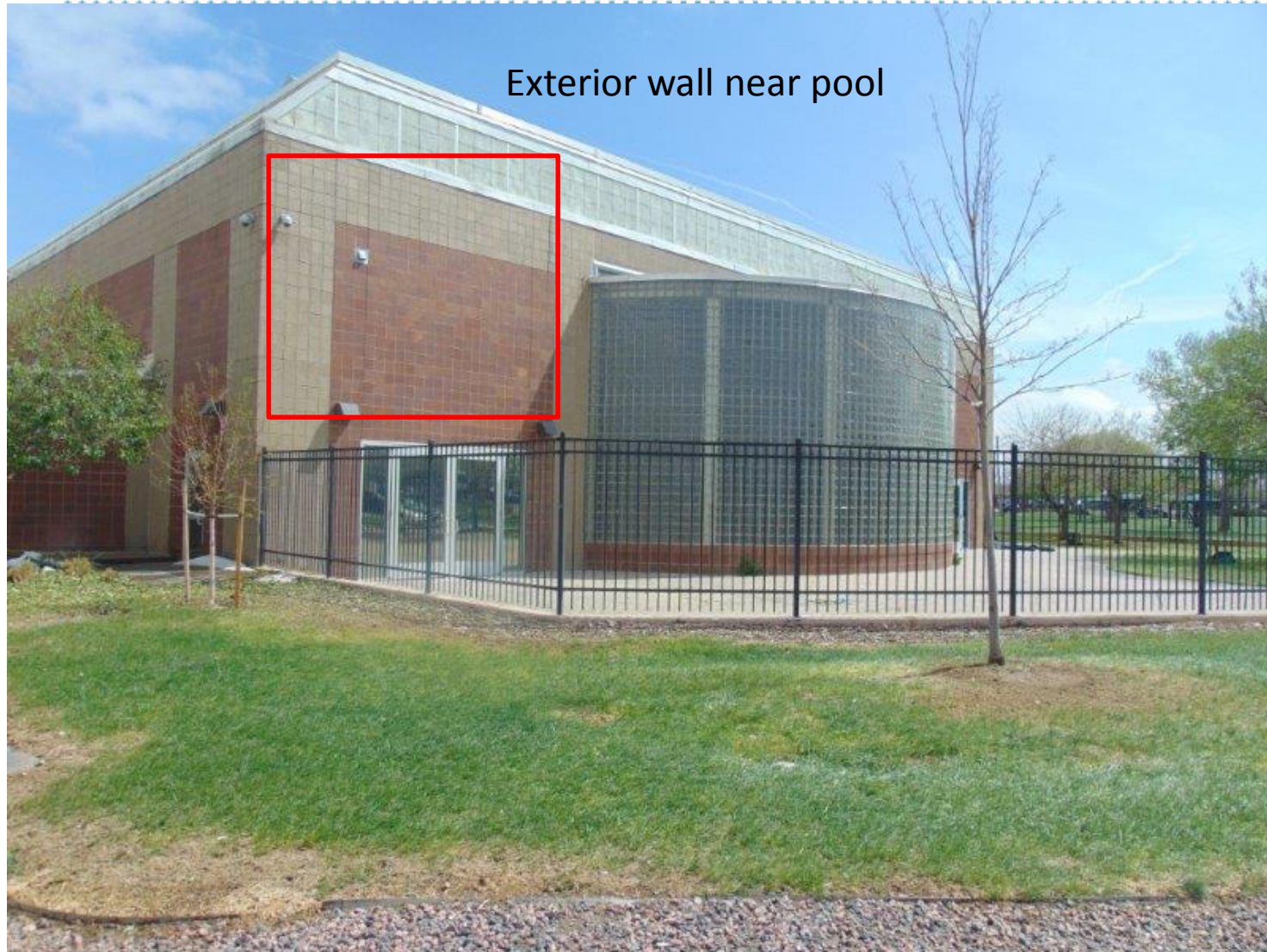
Exterior wall near pool