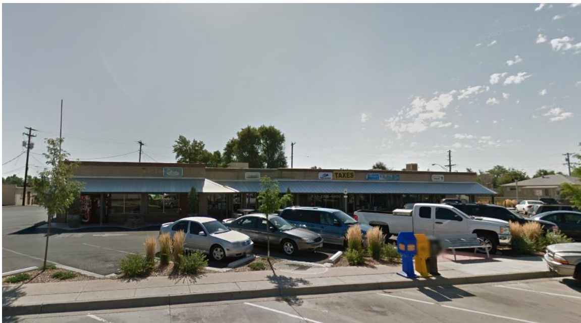
Figure 1: Subject Building

The subject building's architecture has been influenced by the Modern/International style. These architectural styles are defined by the large use of concrete or masonry. Often this style of architecture was utilized to construct buildings with a focus on function rather than form. The image in Figure 1 of the subject building clearly shows that the character of the building has only been influenced Modern/International architectural styles and is not a complete match. This architectural style was prominent across the United States in the 1950s and 60s. This property was constructed to create several storefronts that face along Monaco Street to the west. The building utilizes a parking lot between the building and Monaco Street. The properties surrounding the subject property were built during a similar era and have features that correspond with the architecture of the subject property. Due to the subject property being one of the units within an in-line commercial building, the properties directly to the South are identical in architectural style and the signage that is proposed will replace existing signage that is harmonious with the surrounding uses.