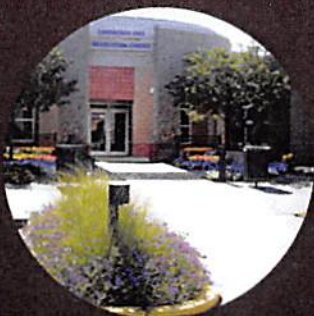
New Additions to Existing Recreation Center