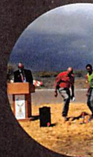
Widening Tower R