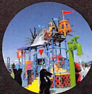
New Outdoor Pool at Pioneer Park

In 2013 Commerce City's voters approved a 1 % sales driven process to identify how to implement programs