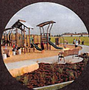
Three Neighborhood Parks