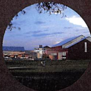
New Recreation Center