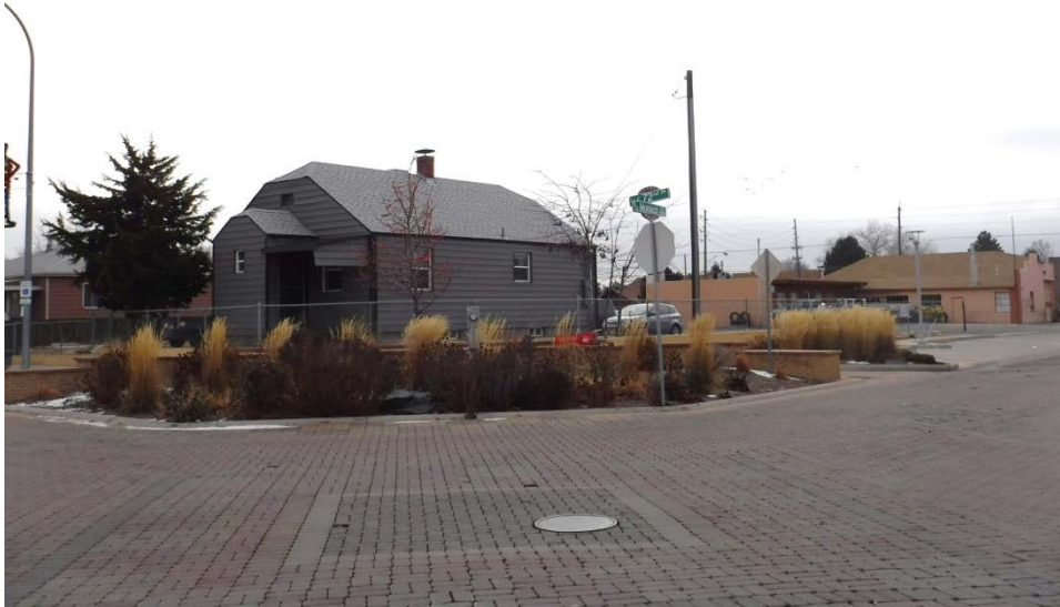
Figure 1: Subject Property

The applicant's proposed improvements are intended to be consistent with the previous fencing improvements located on the southern portion of the property. The style compliments both the Modernist/International architecture of the adjacent Yellow Rose Event Center which the parking lot serves and the more traditional architecture of the historic house on the subject property. Both architectural styles commonly use brick or stone masonry elements, and the proposed stone columns of the fence and stone veneer on the retaining wall will complement the brick color of the Yellow Rose building across the street and the brick used as part of the planters in the Derby Diamond.