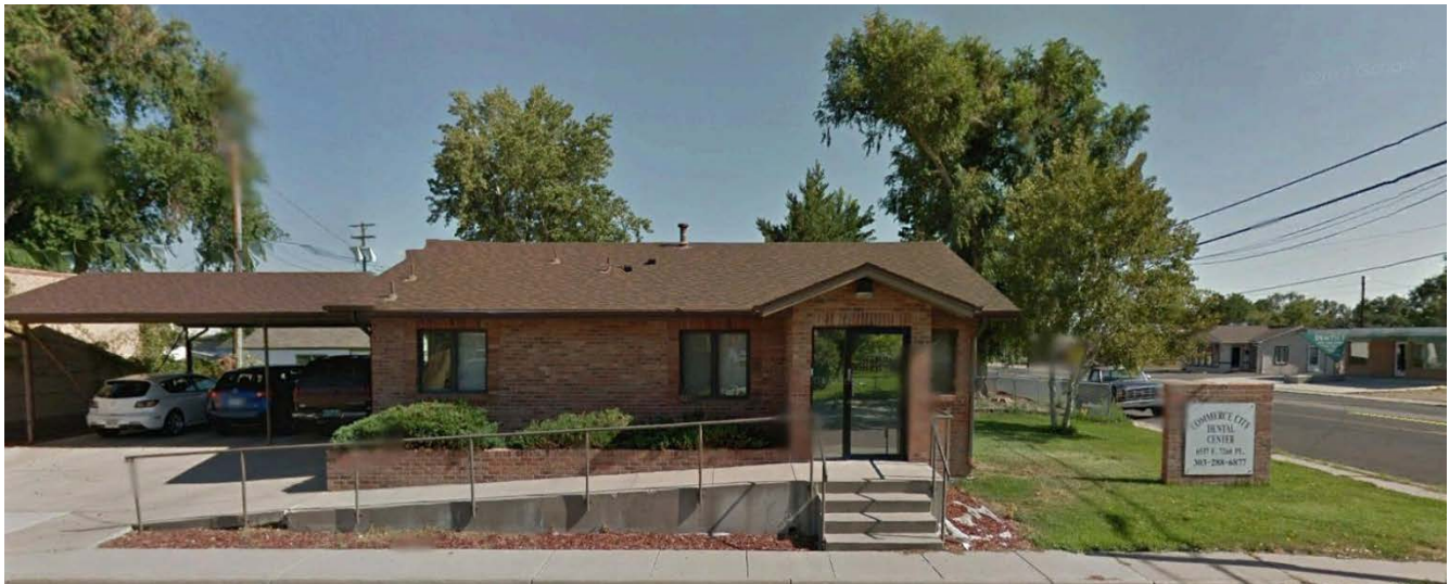
Figure 3: Dental office building to the east

Although the architectural styles throughout the Derby District vary and are not all a match with the subject property, the variety of styles tell the story of commercial development within the Derby Downtown District.