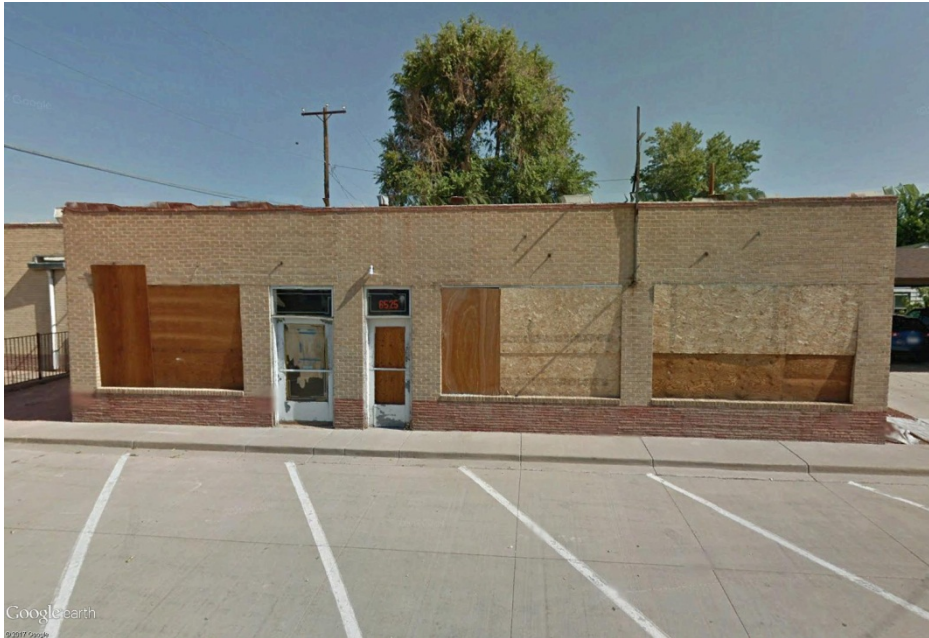
Figure 1: Subject Building

The subject building's architecture has been influenced by the Modern/International style. These architectural styles are defined by the large use of concrete or masonry. Often this style of architecture was utilized to construct buildings with a focus on function rather than form. This architectural style was prominent across the United States in the 1950s and 60s. The building has several angled parking spaces along East 72 nd Place, and a narrow sidewalk between the parking and the building. Although the windows and doors are boarded up, the applicant states that the original window frames from the 1950s are intact, and he intends to reuse them with new glass to preserve the appearance and character of the storefront.