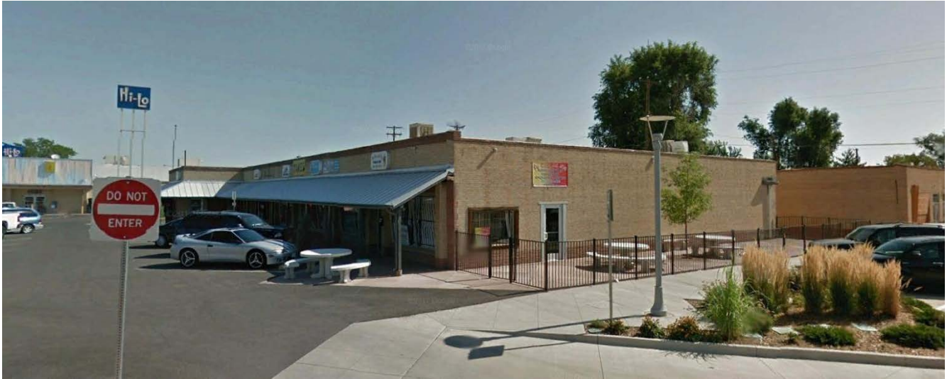
Figure 2: In-line commercial building to the west

To the east, the Commerce City Dental Center building was built in 1991, and does not typify modernist architectural characteristics, but utilizes brick materials that are common throughout Derby. Figure 3 shows the side of the building as viewed from East 72nd Place.