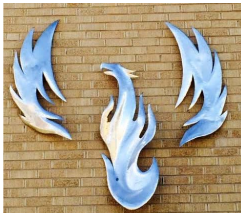
"Phoenix Rising" Stainless Steel 2016 at Lester Arnold High School in Commerce City, CO