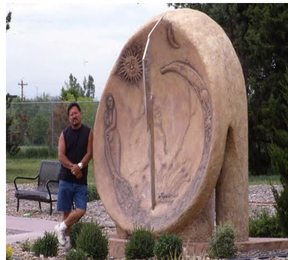
"Aquarius" 2000 Hydro-stone & Stainless Steel (Lightning Bolt) Benedict Park Brighton, CO