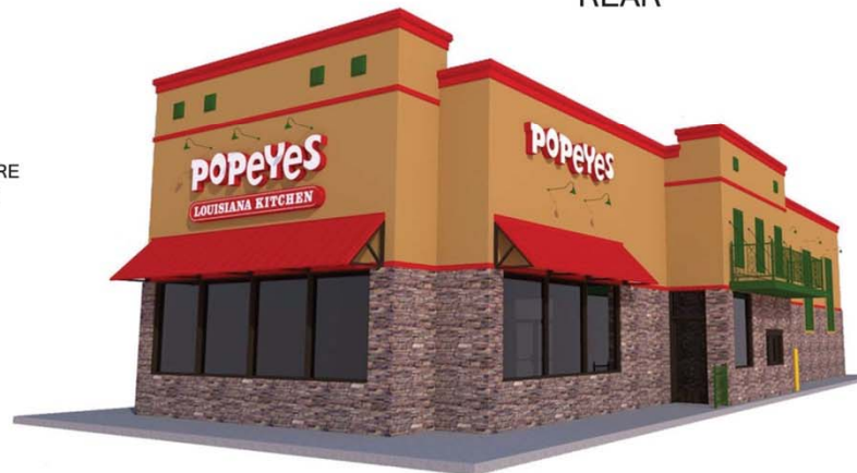
COLORS / MATERIALS