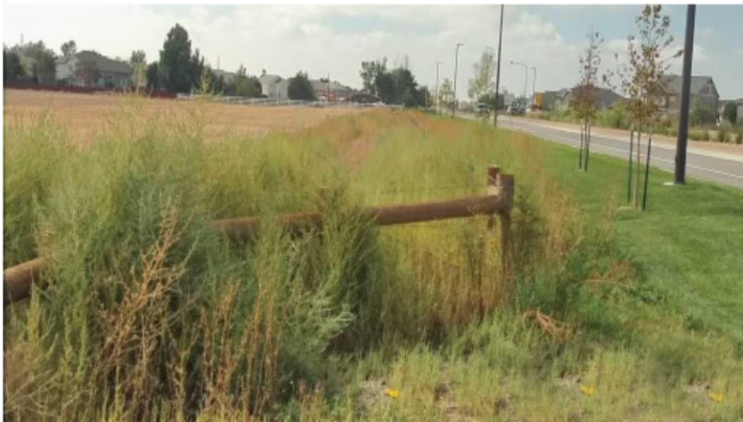
Incorrect: There is no buffer space, and weeds are not maintained beyond the property line.