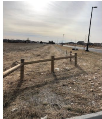
Correct: Buffer space exists and weeds are maintained beyond the property line.