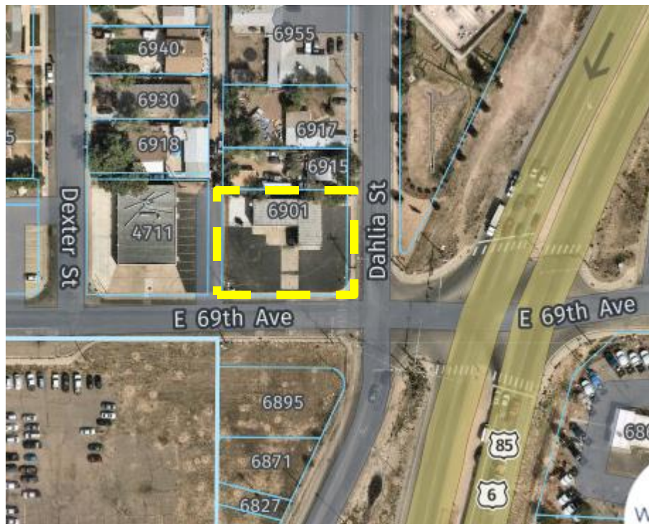
Figure 1: Site Aerial

The proposed site redevelopment is currently under administrative review in case #D-496-21. SACFD is proposing to build a 600-square foot single-story addition to the south side of the existing building for office and firefighter bunk space. Five total firefighter personnel will operate from this facility, with shift changes every other day. The overall layout of the site will remain the same, with some additional parking, landscaping, and site improvements such as the screening wall for the utility area on the east side of the building. A fenced patio area will provide space for staff outside. The existing site is almost entirely paved and this new development will improve the overall site with landscaping and other site