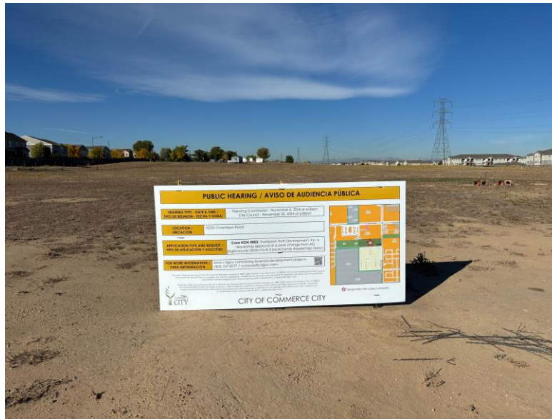
Sign Posted facing Chambers Road