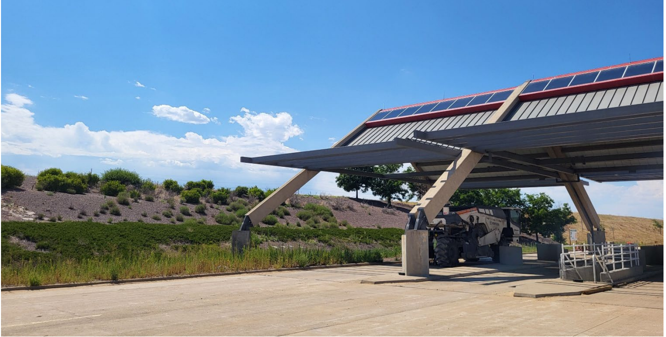
View of the site facing northwest (Taken July 11, 2024)