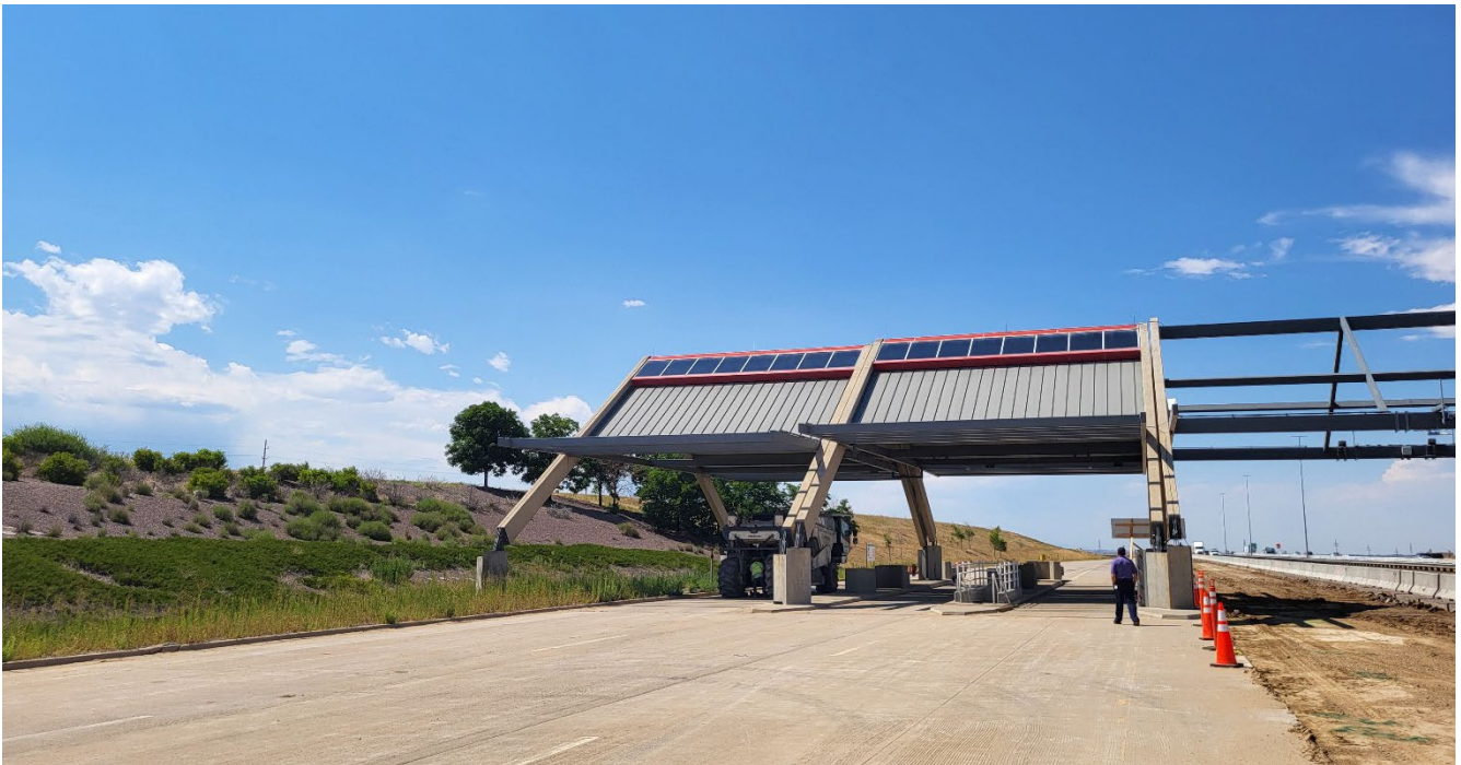
View of the site facing north (Taken July 11, 2024)