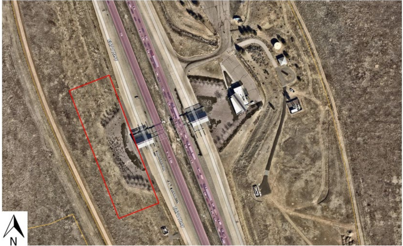
Aerial taken February 24, 2024