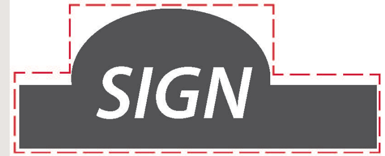
Figure VIII-2. Individual Letter Measurement