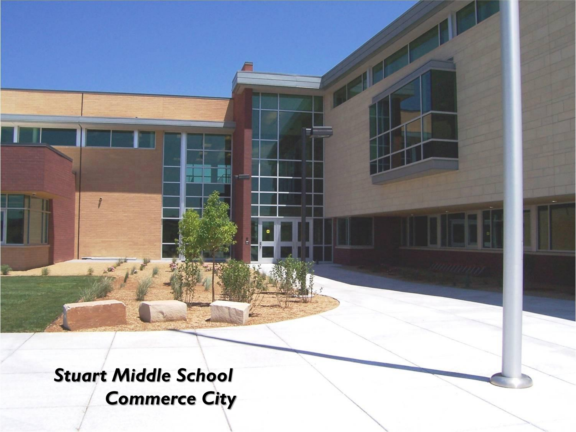
Stuart Middle School Commerce City