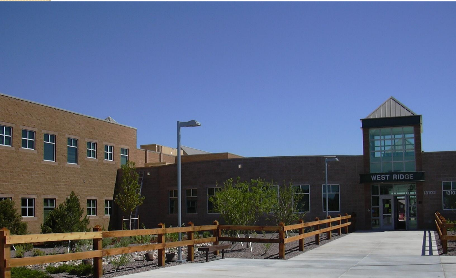
West Ridge Elementary School Thornton