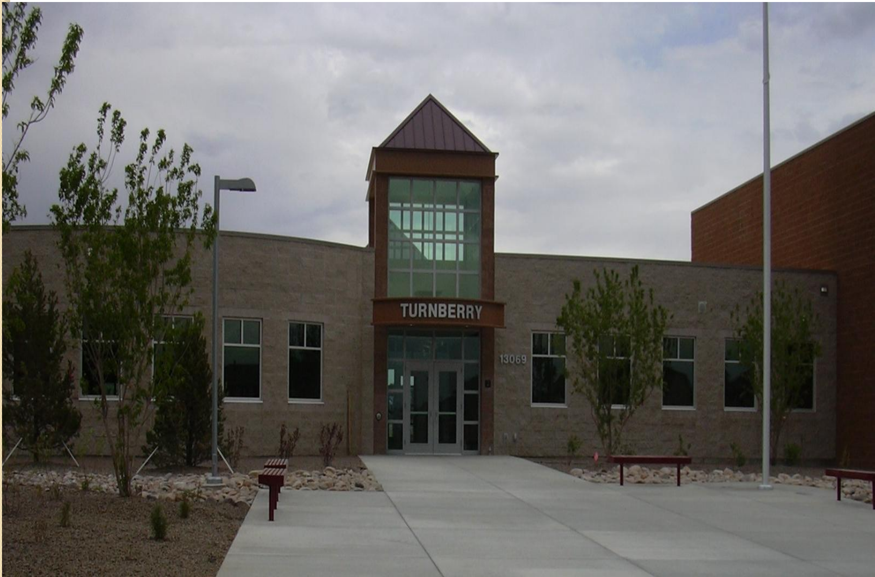
Turnberry Elementary School Commerce City