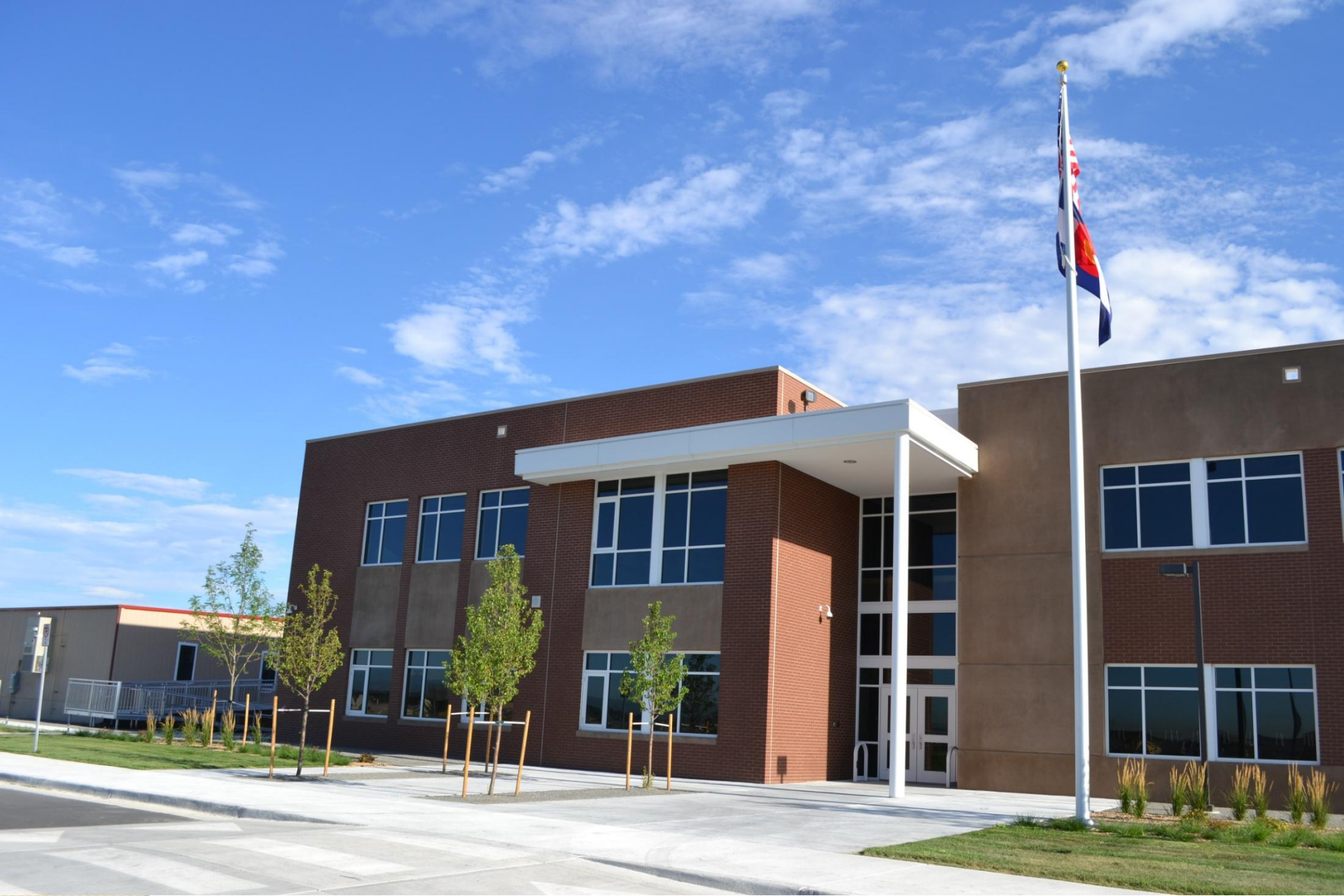
Brantner Elementary School Thornton