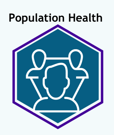
Colorado SIM will support communities as they implement strategies that reduce stigma, promote