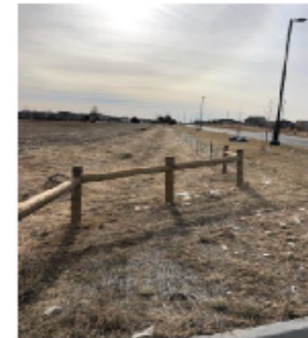
Correct: If the fence exists and weeds are maintained behind the property line.