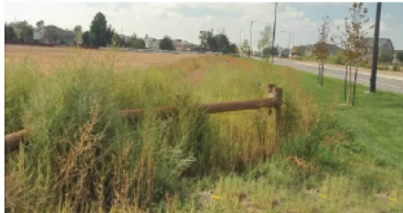
Incorrect: There is no buffer space and weeds are not maintained behind the property line.