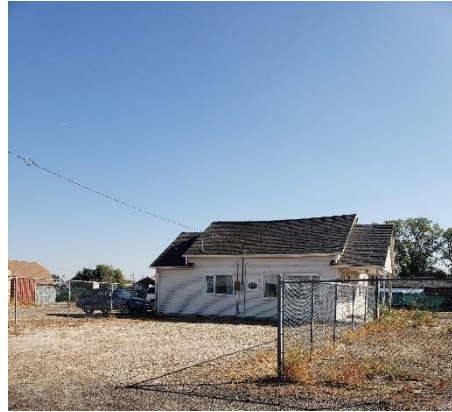
EXISTING BUILDINGS TO BE UPDATED NEW WATER, SEWER, PARKING, LANDSCAPING