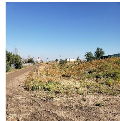
MONROE STREET ROW LANDSCAPE IMPROVEMENTS