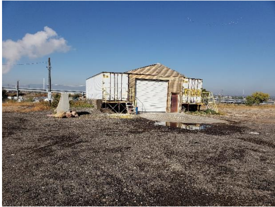
DILAPIDATED BUILDING WAS REMOVED