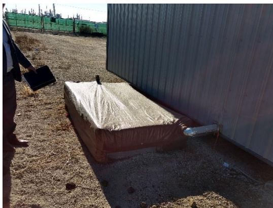
ABOVE GROUND SEPTIC TANK REMOVED