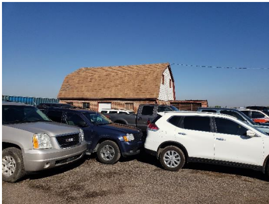
REPO CAR LOT REMOVED