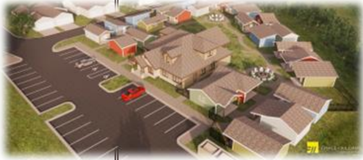
Veteran's Community Project- Longmont, CO