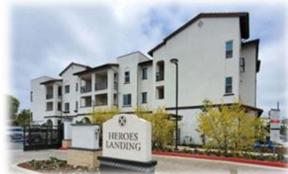
Heroes Landing- Santa Ana