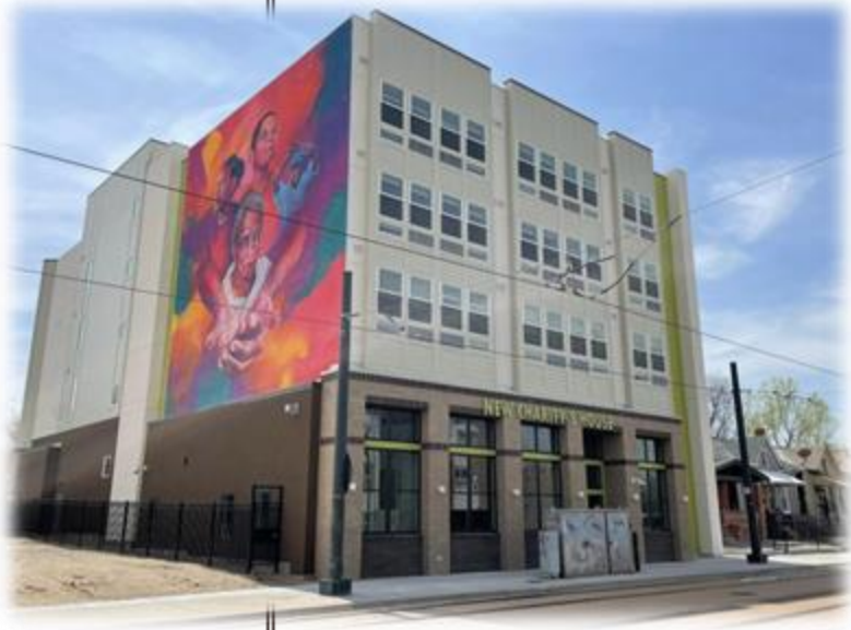
Charity House- Five Points