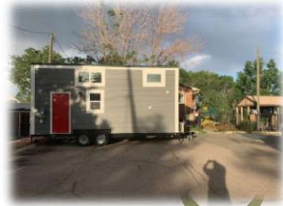
Tiny Home- ACCESS Housing