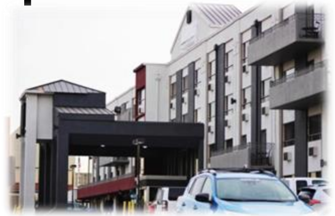
Fusion Studios- Denver