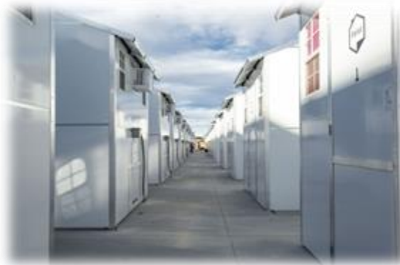
Salvation Army - Aurora, CO