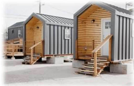
Colorado Village Collaborative- Denver, CO