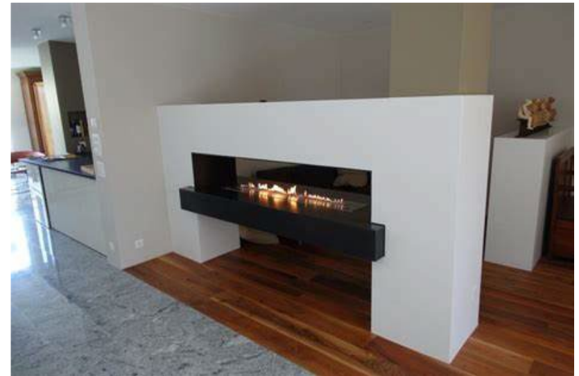
Unvented Alcohol- Burning Prohibited