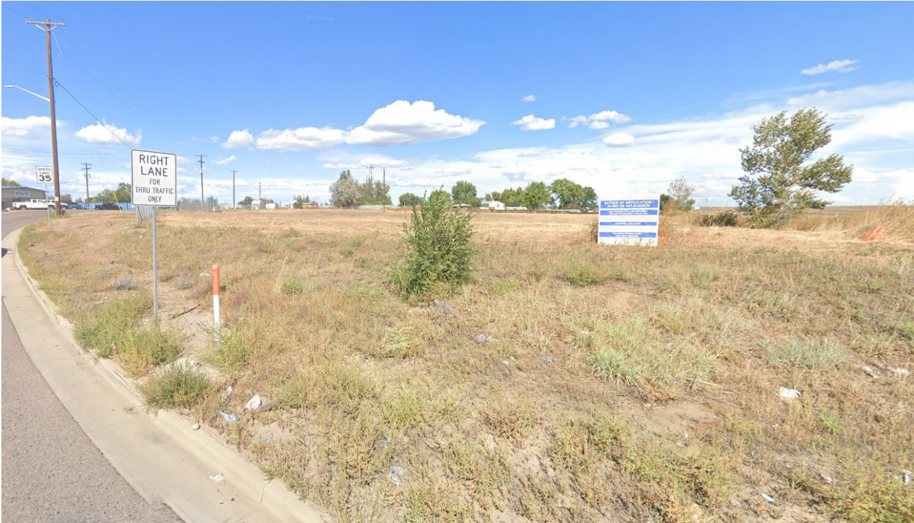
View from Rosemary St. facing north