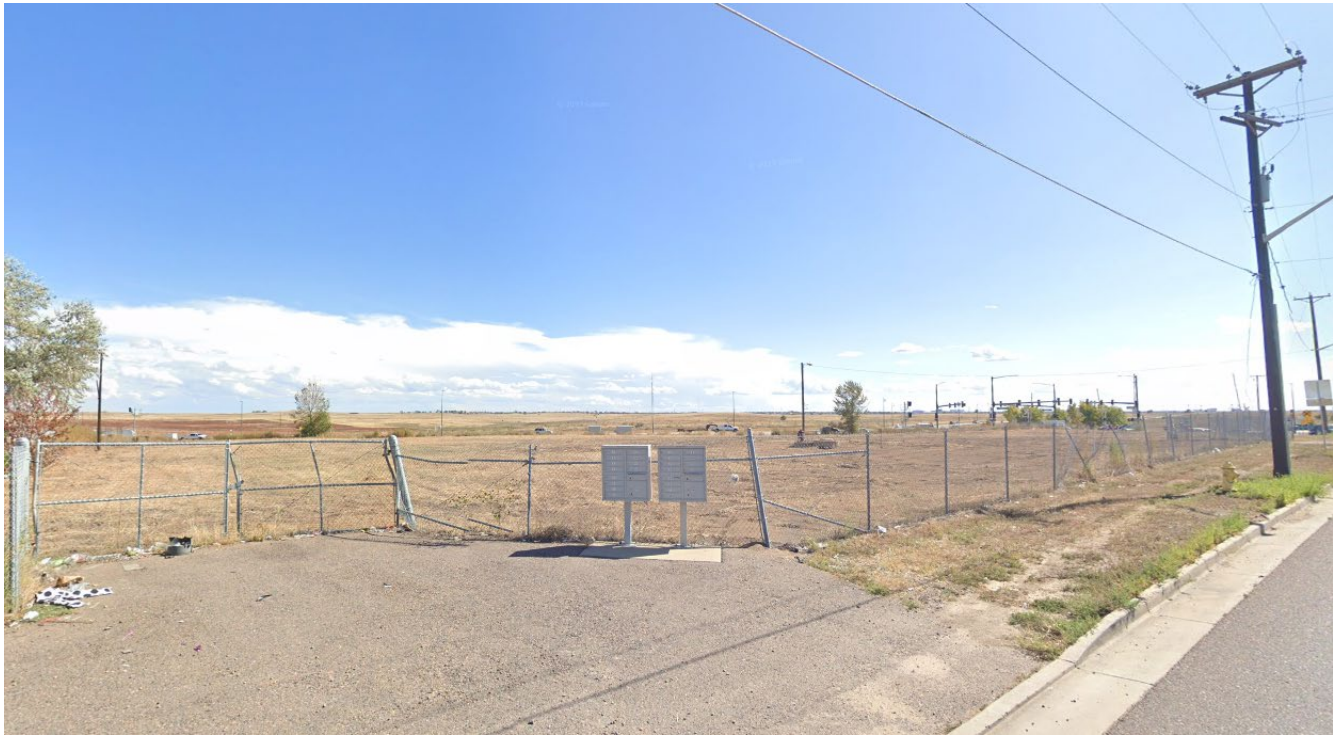
View from Rosemary St. facing southeast