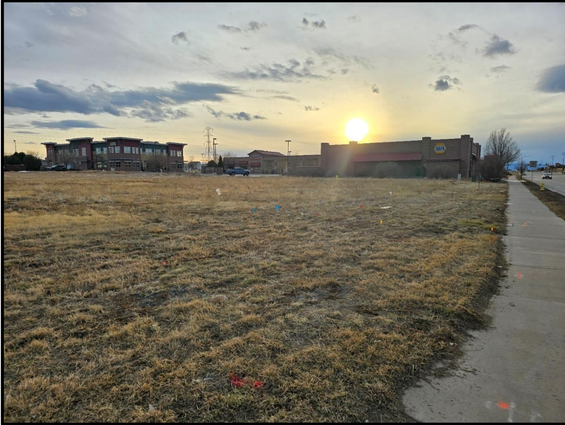
Current view of subject property facing SW from the intersection of E. 104 th Ave. and Tower Rd.