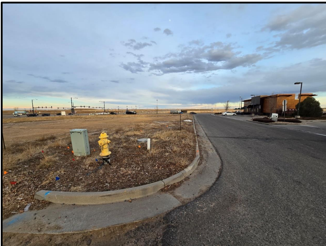
Current view of subject property facing east from the SW corner of the subject site