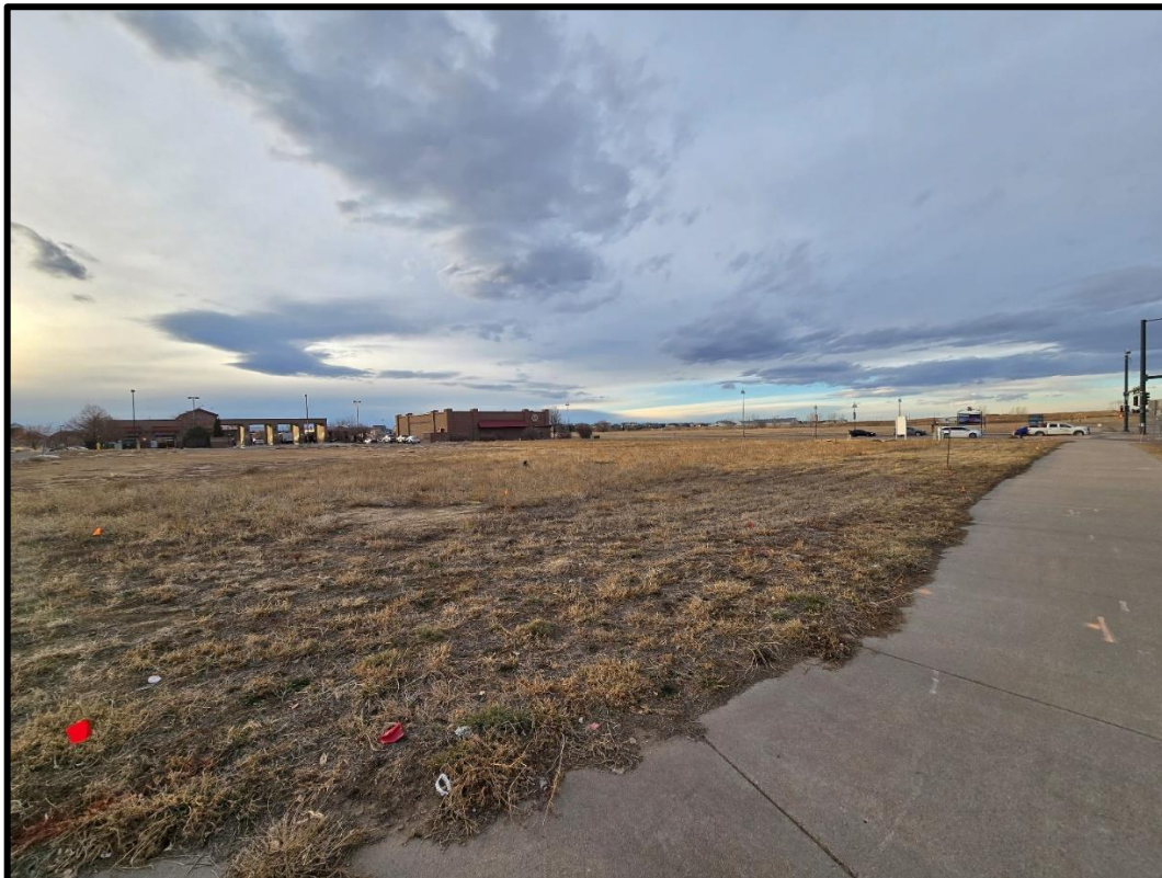
Current view of subject property facing NW from the eastern property boundary along Tower Rd.