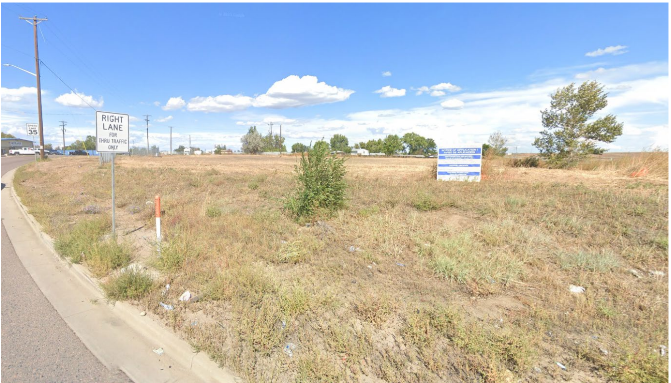
View from Rosemary St. facing north