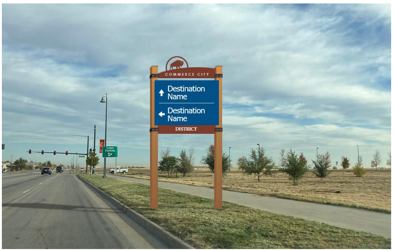
Ver. 1.0. Effective July 2024