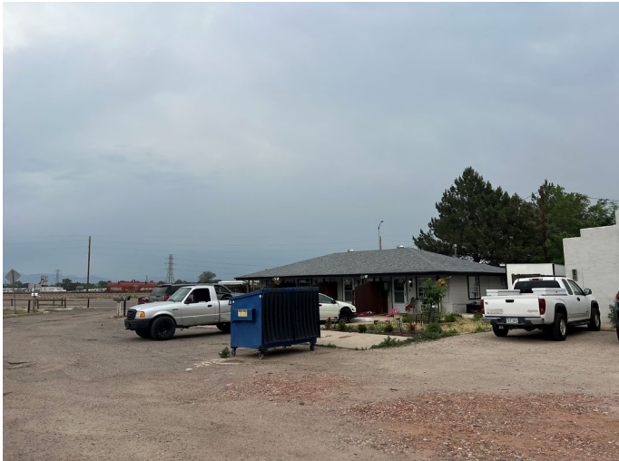
Existing four unit residential building (taken June 14, 2024)