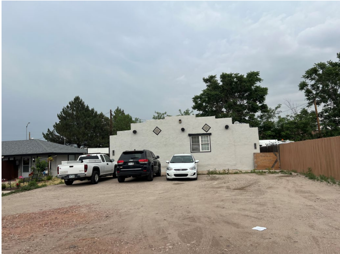
Existing two unit residential building (taken June 14, 2024)