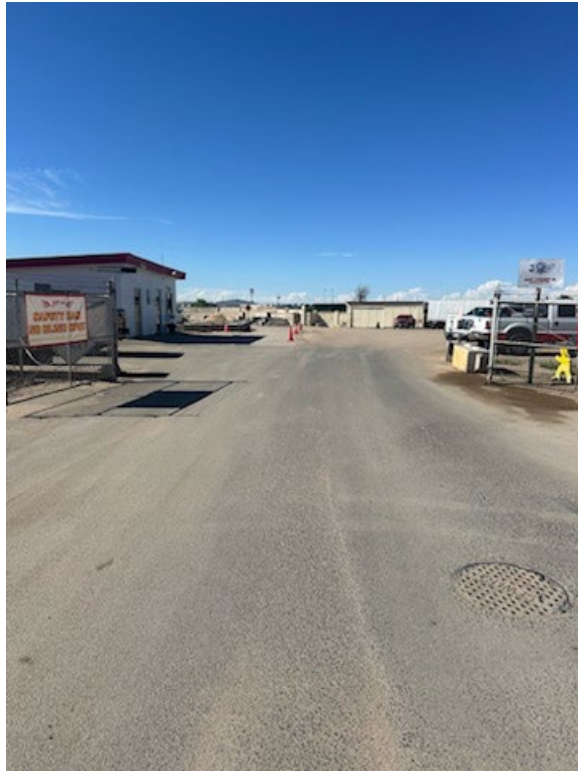
View at End of Forest St/Gates of Property (Taken 6/21/2024)